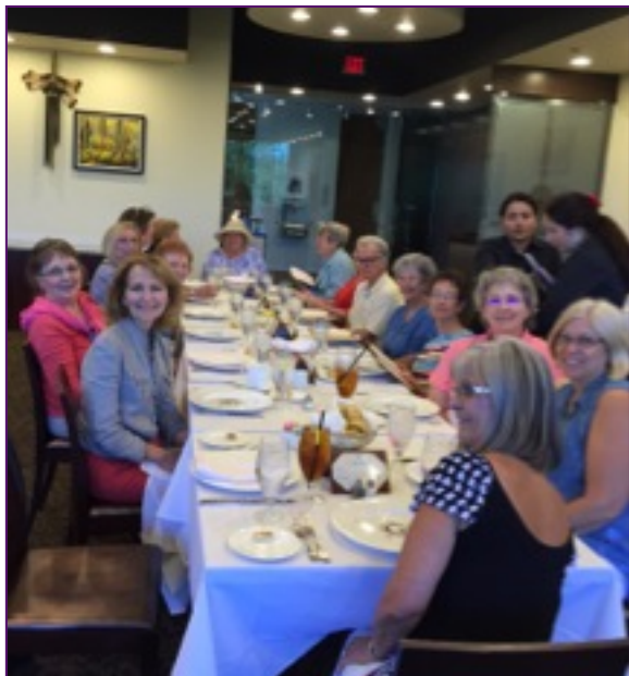
Fourteen GCWS members traveled up the road to Gilcrease Museum after our May meeting. We all enjoyed lunch, then a tour of the Museum.